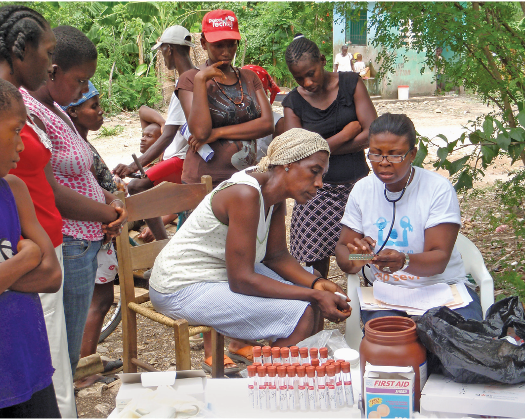
IN HAITI: Women gather at an improvised IPPF-affiliated family planning clinic after an earthquake in 2010.

this phase, they worked to align the draft indicators with IPPF's goals and principles, and they identified and resolved obstacles to making the indicators work in various local contexts.